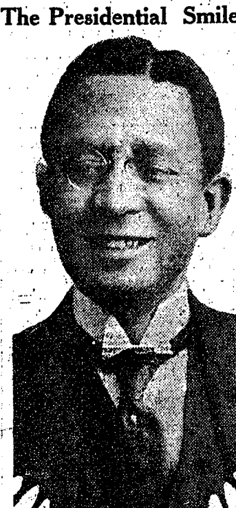
EDWIN J. BARCLAY, former Secretary of State, who was sworn in last week as President of Liberia, West Africa, to fill the unexpired term of President King.

Militia Called Out to Parade Streets and Machine Guns Mounted on War Department Building. The Presidential Smile