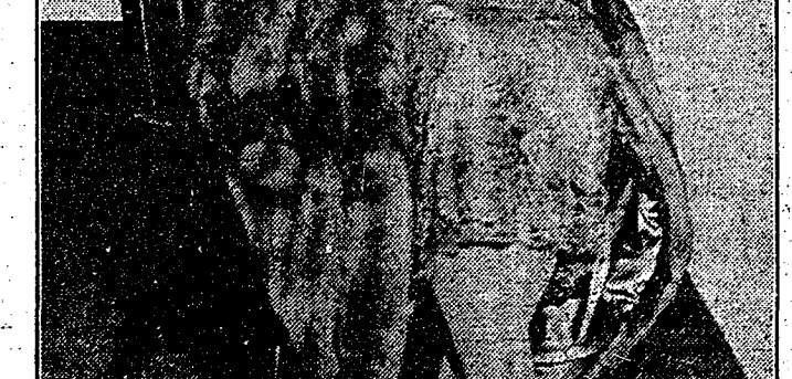
MME. STEPHANIE ST. CLAIR, wealthy French octoroon and Harlem Numbers Queen, who testified in the recent New York police shakeup that she made regular payments to police officials, who, nevertheless, failed to protect her racket. She was born in France and came to this country where she acquired a fortune as a numbers banker. She is shown as she appeared in court in her mink coat and wearing jewelry that could be converted into a small fortune.