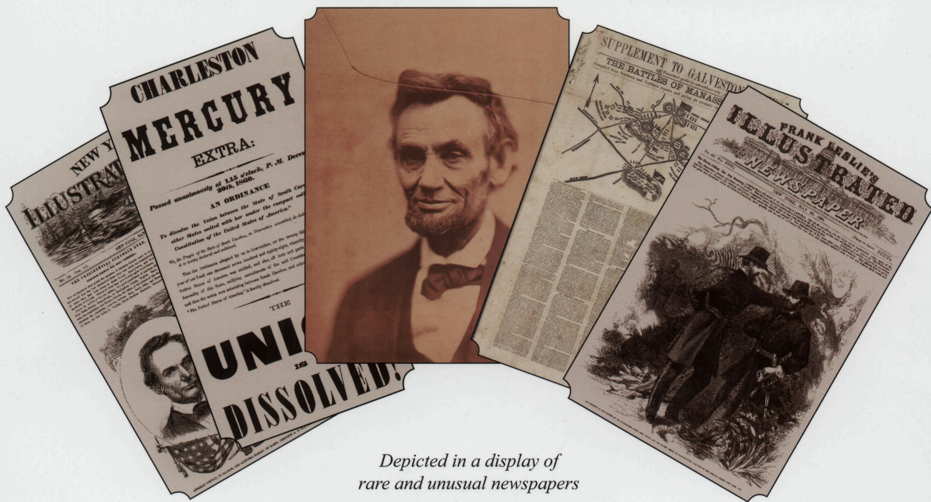
Depicted in a display of rare and unusual newspapers