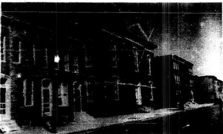
This block of Division Street, closed to traffic during school hours, provides play space.