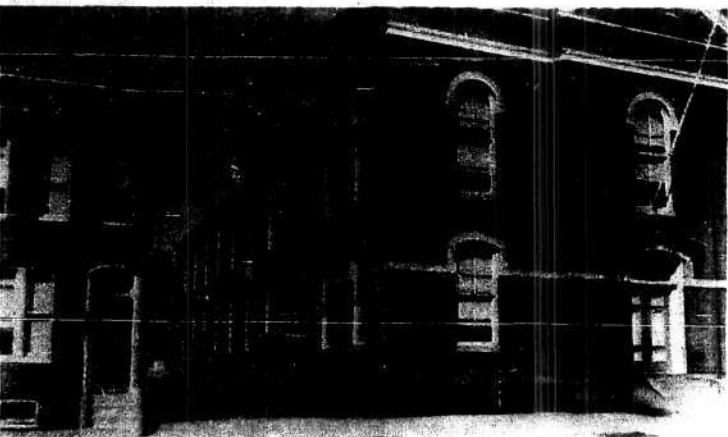
North and west faces of building, left and right respectively.