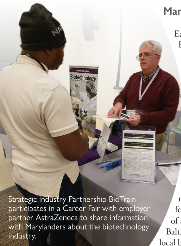
Strategic Industry Partnership BioTrain participates in a Career Fair with employer partner AstraZeneca to share information with Marylanders about the biotechnology industry.

Finally, the Partnership for Tech Talent, led by Per Scholas, recently participated in a study with the W.R. Upjohn Institute for Employment Research, which confirmed that their work is helping their employer partners to diversify their workforce.