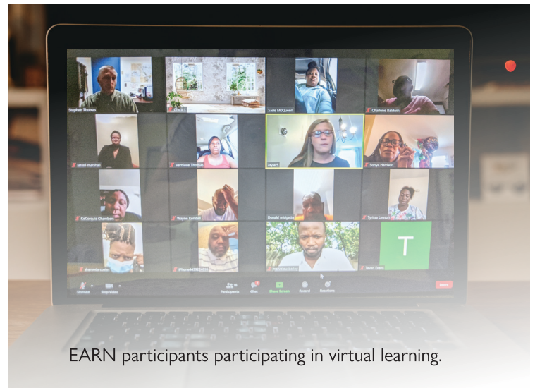
EARN participants participating in virtual learning.

Specialized Nursing Bridge Program nurse cohort diligently working to help fight the spread of COVID-19.