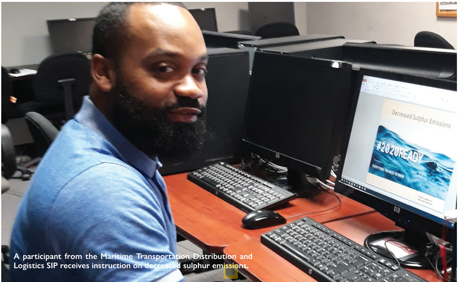
A participant from the Maritime Transportation Distribution and Logistics SIP receives instruction on decreased sulphur emissions.

its annual Hackathon event virtually this year. The event brings together tech employees from different companies in the Frederick area, forming teams to develop software solutions for nonprofit organizations in need. The teamwork, camaraderie, and dedication of these professionals and the ultimate delivery of high caliber tech solutions for nonprofit organizations is a shining display of the strength of the tech community in Frederick, which has been formed and fostered as a result of EARN.