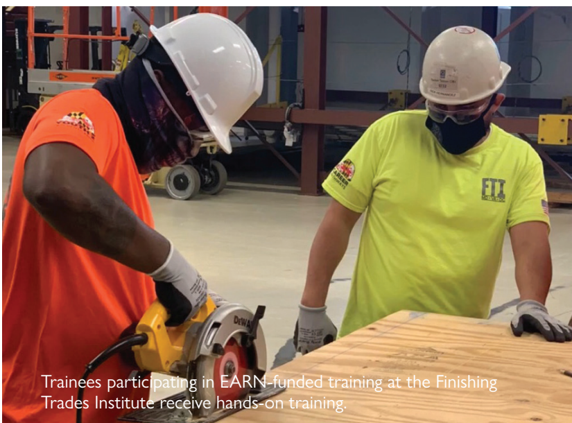
Trainees participating in EARN-funded training at the Finishing Trades Institute receive hands-on training.

While job readiness and essential skills training remains a high priority for employers, the specific needs have changed due to COVID-19. For instance, partnerships needed to quickly develop training on how to work professionally in a virtual environment, including increased training on email etiquette and how to utilize virtual meeting platforms.