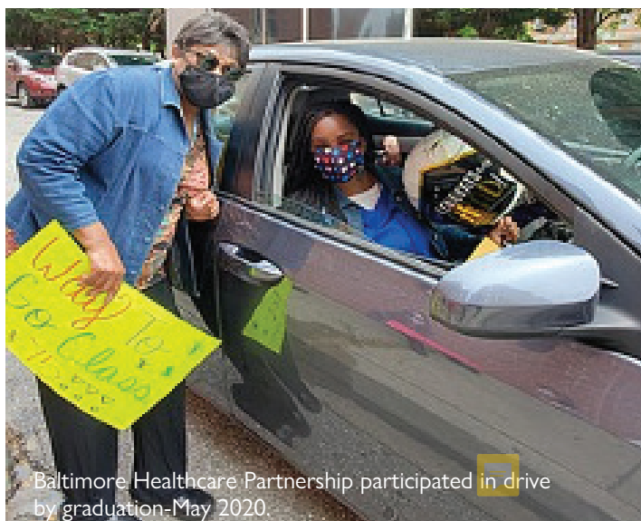
Baltimore Healthcare Partnership participated in drive by graduation-May 2020.

The Specialized Nursing Bridge Program, led by Adventist, continues to work to increase retention among first year nurses through their nurse preceptor training program. It has been estimated that 43 percent of new nurses tend to leave the field within the first three years. The training provides added support and learning in an effort to decrease this attrition. A skilled healthcare workforce is needed now more than ever, and the partnership was able to train one of their