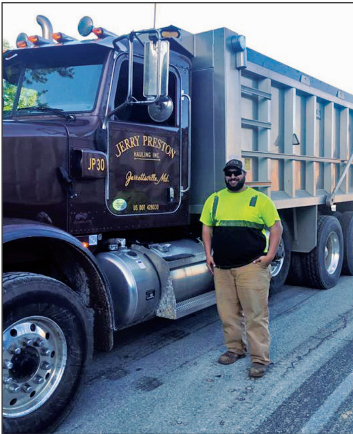
A graduate of the Susquehanna Transportation and Logistics Partnership visits training with his new vehicle.

newly developed diesel mechanic training in 2020. For example, based upon industry feedback, Anne Arundel Workforce Development Corporation, who leads A Road to Success, has developed a 200-hour training, which incorporates classroom instruction and hands-on experience. Candidates who complete this comprehensive training will be prepared for entry-level positions as technicians in diesel engine repair and related fields and will be eligible to sit for the Automotive Service Excellence (ASE) Automotive Maintenance and Light Repair (G1) certification exam.