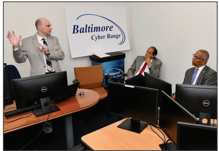
Lieutenant Governor Boyd Rutherford receives a briefing on the work of Baltimore Cyber Range, who leads two EARN partnerships.

The Intrusion and Countermeasures Education and Training Partnership is responding to the call of its 31 employer partners to provide a blend of classroom and hands-on training to ensure students have not only the technical knowledge, but also the practical skills necessary to be successful in the industry. Upon earning A+ and Net+ certifications, students receive employer-identified hands-on training at Baltimore Cyber, which includes simulations that mimic real-life cybersecurity threats. To date, more than 100 individuals have been placed into employment, earning an average wage of more than $17 per hour. In September of 2019, Lieutenant Governor Boyd Rutherford visited Baltimore Cyber to learn more than their efforts to create a pipeline of highly skilled workers for Maryland's cybersecurity employers.