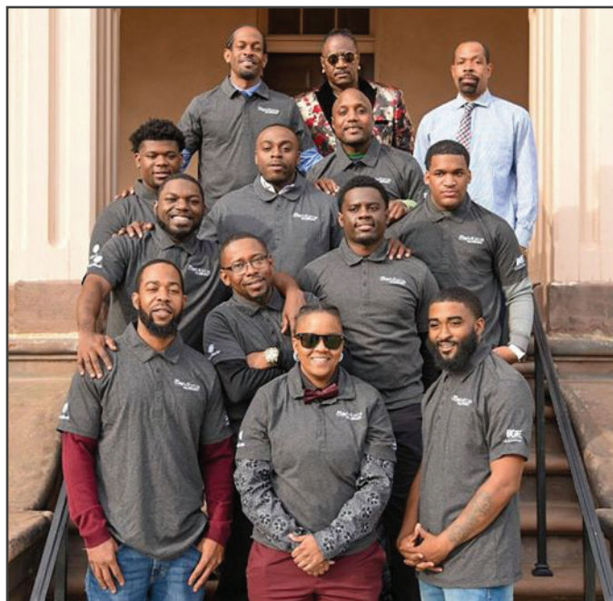
Graduates of the Remediation Construction Industry Partnership

Given the feedback from its employer partners, the Remediation and Construction Industry Partnership is providing in demand training to grow the pipeline of qualified workers to be Brownfields Remediation and Stormwater Management Technicians. Participants earn a plethora of certifications, including EPA Asbestos Supervisor; Lead Abatement Worker; OSHA 40 Hour Hazardous Site Worker Protection and Emergency Response, OSHA Confined Space Operations; OSHA Bloodborne Pathogens; and OSHA Fall Protection. To date, 99 participants have completed training, of which, 91 (92 percent) have obtained employment. In 2019, the RCIP developed a partnership with Baltimore Gas and Electric to connect RCIP graduates with careers in the utility infrastructure industry. In addition, BGE awarded lead applicant Civic Works a grant to expand the RCIP curriculum and develop new partnerships with utility infrastructure employers. This funding will allow the RCIP to scale operations, and enable the partnership to expand its services.