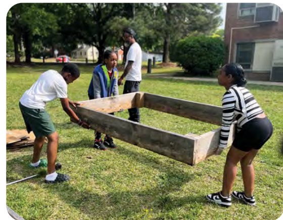
Students install a food and pollinator garden at Lakemont Elementary School in Petersburg as a part of the Virginia Association of Environmental Education’s plans to bolster civic engagement and leadership skills.

Gallaudet University, $50,000 for an urban farm and agricultural training