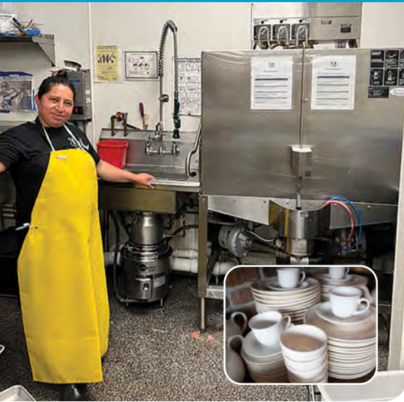
An employee from B. Lin Catering shows off a new dishwasher purchased to help the company “ditch the disposables” and lead the industry toward more sustainable catering practices.

STARBASE Victory Inc, $5,000 for 24 students to study the effects of microplastics