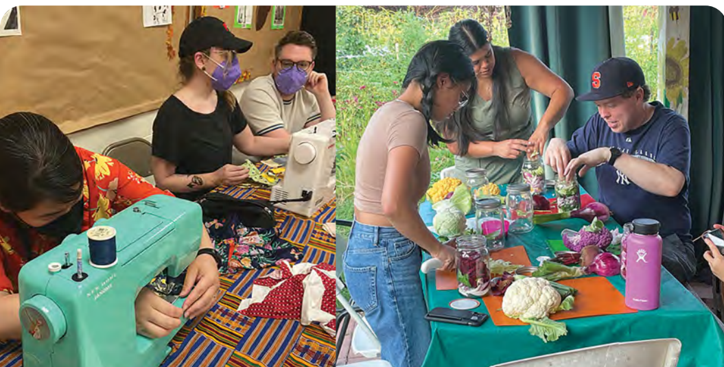
Left: District residents learn sewing and canning techniques through Common Good City Farm's workshop series aimed at reducing waste. Participants honed skills in upcycling and mending clothing as well as pickling vegetables and producing jams.