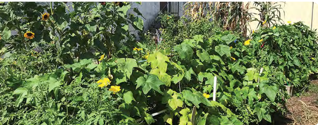
The Ashland Community Development Corporation's gardens prove that simple, outdoor hydroponic systems can thrive in urban settings. ACDC uses these gardens to educate neighbors on gardening techniques and to compare water usage results against traditional raised bed gardening.

Summit School, Anne Arundel County, $5,000 to restore an outdoor classroom for climate change education