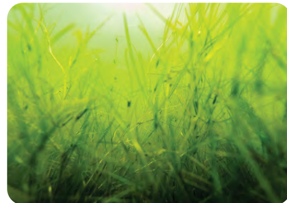
Tetra Tech, Inc. uses geospatial modeling to identify the most effective methods for protecting submerged aquatic vegetation habitats.