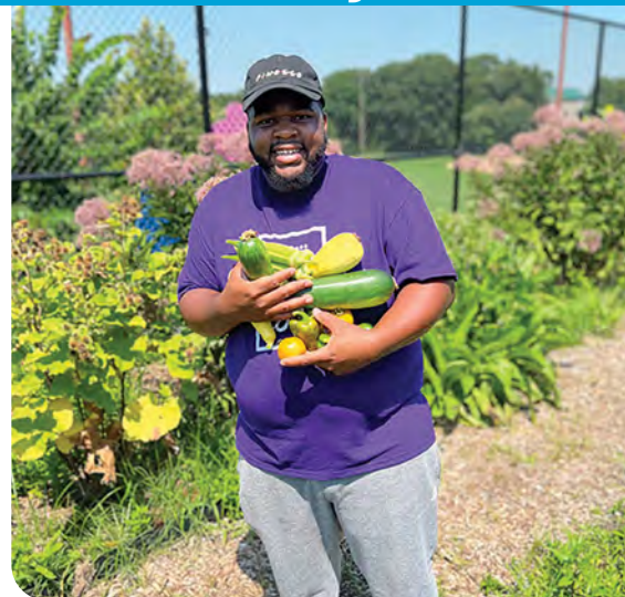
An urban farmer proudly presents his recent vegetable harvest. The Dreaming Out Loud urban farm and food hub engages Wards 7 and 8 residents in hands-on farming to eliminate food deserts and provide fresh fruits and vegetables to neighbors.

Town of Bath, $55,440 to revitalize an abandoned rail yard into a community green space