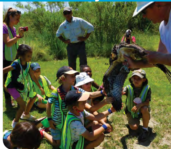
Through the Maryland Environmental Service and the Maryland Port Administration, South Baltimore campers learn about ospreys and other local bird populations during a week-long immersive birding camp that included field trips, boating, and art activities.