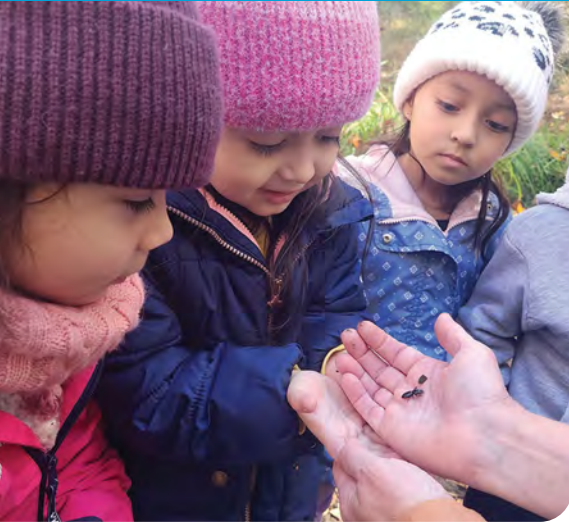
Pre-K children explore nature and learn about wildlife through Nature Forward's Play and Learn programs.