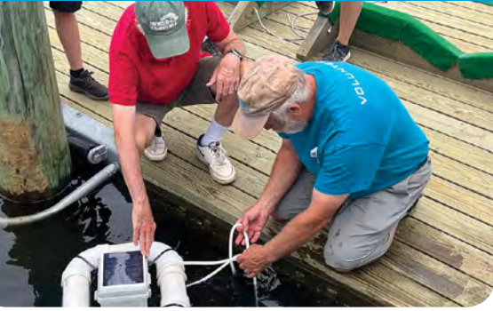
Volunteers use water quality monitoring kits provided by St. Mary's River Watershed Association to support oyster restoration on St. Mary's River.