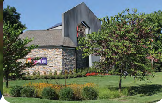
Congregants of University Christian Church in Hyattsville installed rain gardens, planted native trees, and replaced impervious parking surface to reduce flooding on their hillside and neighborhood sidewalks. Their stormwater management project will increase filtration and reduce sediment flow into Wells Run, a tributary of the Anacostia River.