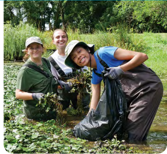
Chesapeake Conservation Corps members remove invasive water chestnut from the Sassafras River on a service learning day facilitated by ShoreRivers and its Corps member.

Howard County Conservancy, Inc., $5,000 for its Youth Climate Institute