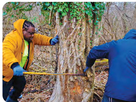
Above: Ward 7 and 8 residents lead restoration efforts at Anacostia Park through The Friends Corps RSTOR Initiative, a community-led watershed rehabilitation program that focuses on trash removal, invasives eradication, and tree planting.

Experience Learning, $5,000 for a professional development workshop for 24 K-12 educators