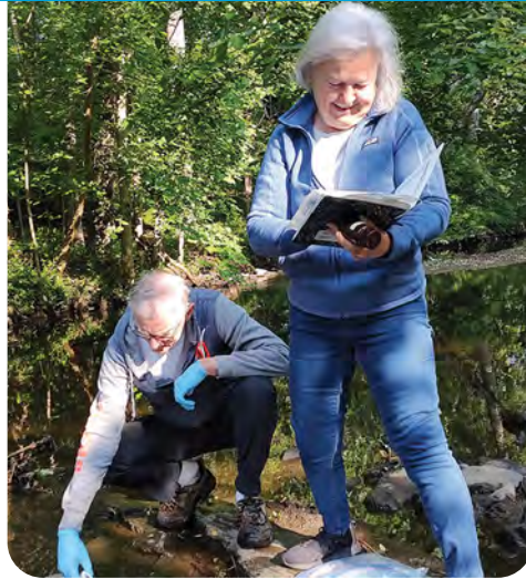
Anacostia Riverkeeper leads clean-up events to remove trash from streams that causes harm to wildlife and creates microplastics pollution.