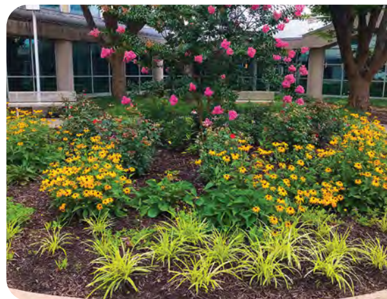
MedStar Good Samaritan Hospital created a green courtyard for staff, patients, and visitors to relax and learn about the benefits of pollinator and native plants.