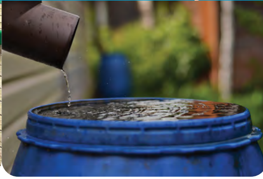
The Town of Keedysville's Green Team empowers residents to "go green" and take meaningful stewardship actions with a rain barrel and compost bin program.