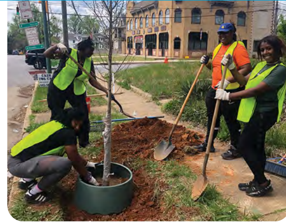
The Baltimore Tree Trust connects residents to training and jobs in the urban forest industry through their Neighborhood Foresters Initiative.

Rev Samuel Green Sr Foundation, $300,000 for community trees