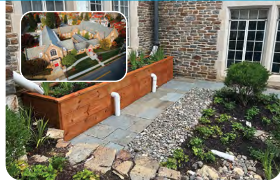
Parishioners take solace in the rain gardens installed at the Towson Presbyterian Church's courtyard; gardens feature native plants and will improve stormwater management and attract pollinators.

Gunpowder Valley Conservancy, $74,050 for bioretention, rain barrels, and an outdoor learning area at Divinity Lutheran Church