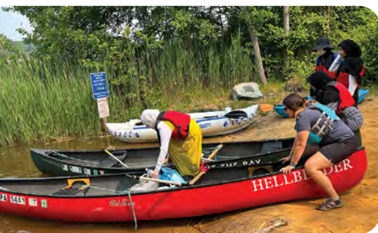
Students from the Al Rahmah School prepare to explore the water as part of their new environmental curriculum introducing the importance of watershed conservation.

Notre Dame of Maryland University, $66,113 to evaluate K-12 environmental education practices