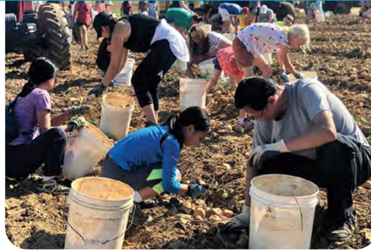
The Chinese American Parent Association of Howard County promotes awareness about the environmental-mental health connection by teaching youth how to garden, coordinating community clean-ups, and hosting vegetable and fruit pick-ups for charities.