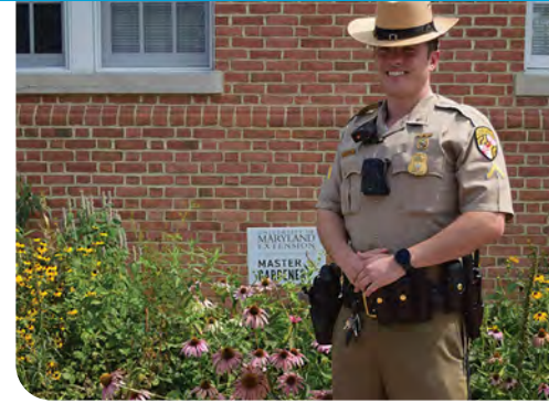
The Maryland Troopers Association planted pollinator gardens at the Bel Air State Police Barracks to manage stormwater and to encourage the growth of vital pollinator populations.

Sisterhood Agenda Inc, $4,210 for a community garden at a holistic housing development