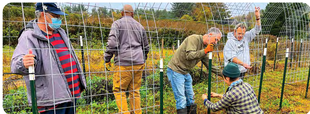
Veterans install trellises for a hoop house over raised vegetable beds at the TALMAR Gardens & Horticultural Therapy Center. The Trust funded upgrades to make garden therapies more accessible to veterans with limited mobility and lung capacity.