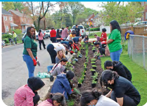
Residents of the Town of Edmonston proudly come together to plant rain gardens on the region's fourth industrial Green Street.

50 veterans and their canine companions navigate an outdoor obstacle course at the 2023 Warrior Canine Connection Ruff Mudder, an outdoor wellness event.