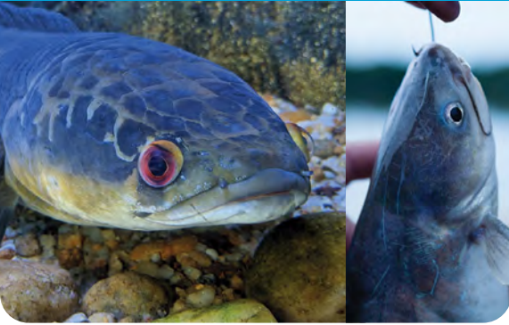
Invasive snakehead and blue catfish are caught through an invasive species control program led by an expert team of Piscataway Canoy tribal citizens. The catch is donated and dispersed among elders and families with children in the tribal community.