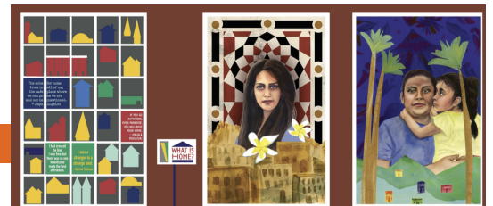
What Is Home Art Installation