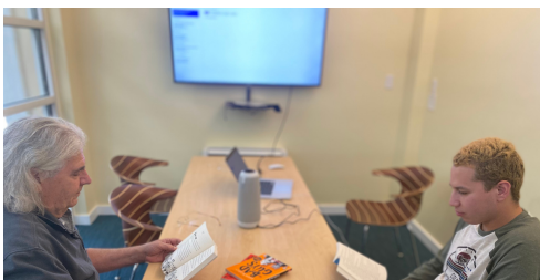
Guys Read Program with QACPS