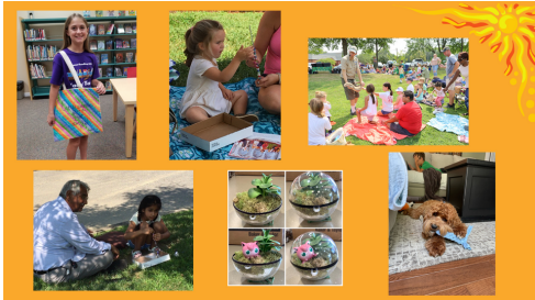
Summer Reading Fun