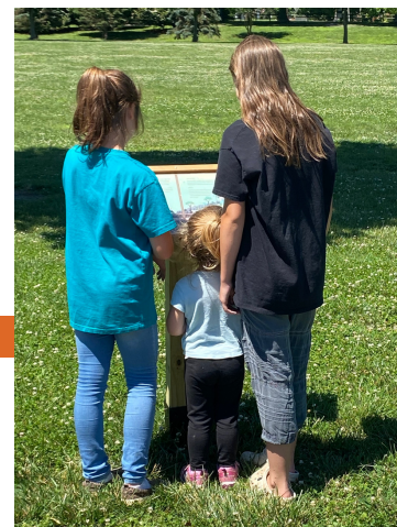
StoryWalk Partnership with QAC Parks & Recreation