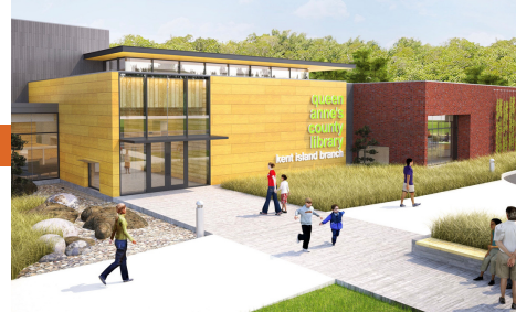
Kent Island Expansion Begins