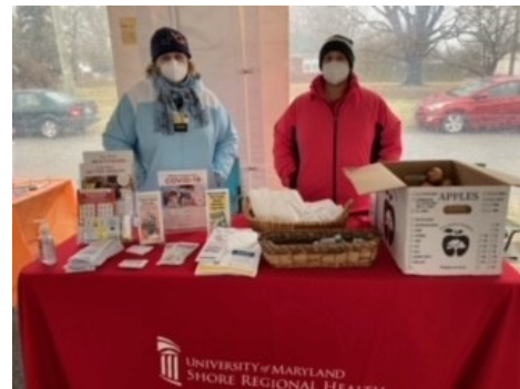
University of Maryland Shore Regional Health at Chestertown - Mobile Wellness Team Project, Eastern Shore.

FY2020 RMC award funds were returned to RMC in the amount of $5,542.51 from Garrett Regional Medical Center on April 21, 2022 for their Patient Ambassador Program, which was discontinued due to COVID-19