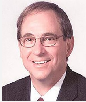
Senator George Edwards