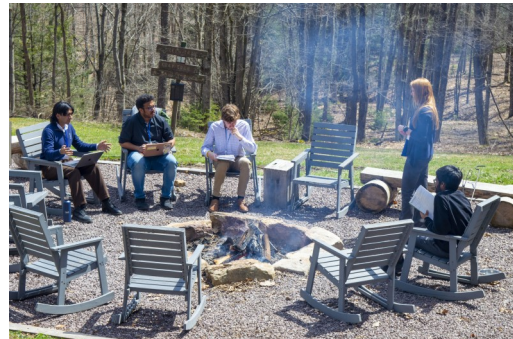
The Greater Cumberland Committee - Forest Products Brand Development ESG Charette, Western Maryland