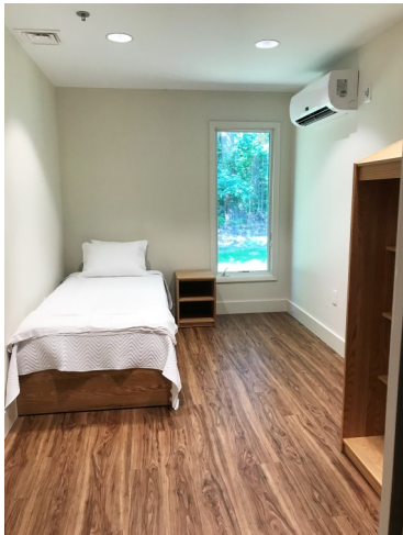
Channel Marker - Psychiatric Crisis Bed program, Eastern Shore.