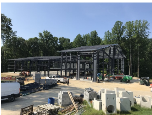
End Hunger in Calvert County - construction of warehouse facility for regional food hub distribution, Southern Maryland.