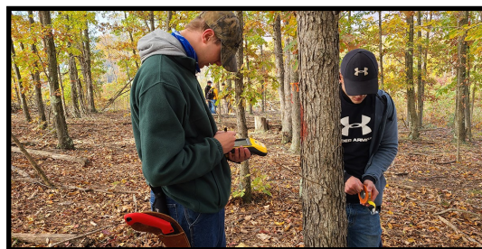
Allegany College of Maryland - Enhancing Forestry Education Program