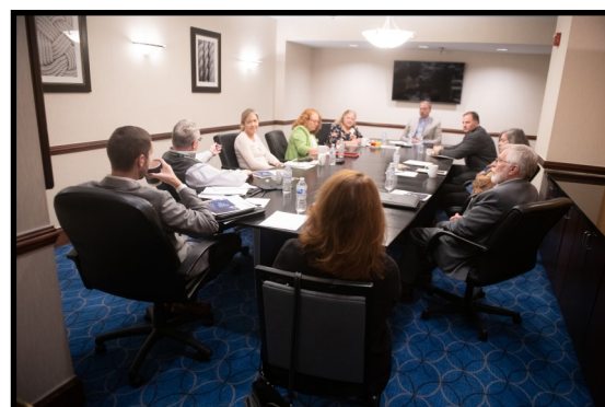
Transfer of Wealth workgroup gather at the 2021 Rural Summit.

The Rural Maryland Foundation continues to support efforts to retain wealth in rural communities. As a continuation of this work, the Foundation has studied the transfer of wealth phenomenon and developed a statewide rural philanthropy strategy. The Foundation convened its Transfer of Wealth workgroup during FY2022 and will continue its efforts to engage with the Maryland Philanthropy Network.