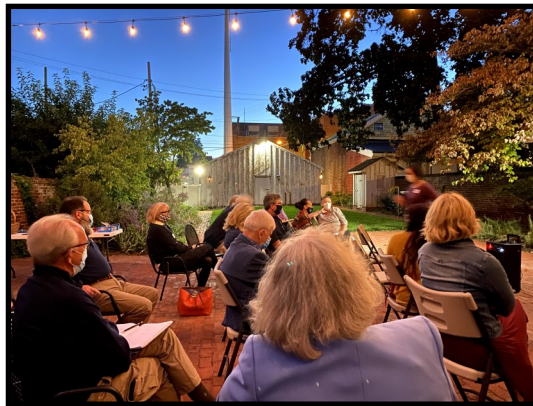
Heart of the Civil War Heritage Area, Inc. - Strategic Planning Listening Session, Carrol, Frederick, Washington Counties.

Project Summary - The Parents' Place of Maryland's mission is to empower families as advocates and partners in improving education and health outcomes for children with disabilities and special healthcare needs with a commitment to diversity and equity. The purpose of the Empowering Parents and Youth with Hidden Disabilities project is to facilitate a four-day training series for families that empower them to gain disability pride as well as self-advocacy and transition planning skills so that youth may develop self-directed transition portfolios for usage in their Individualized Education Programs (IEP). This training includes but is not limited to topics such as: the laws related to the Rehab Act of 1973 Section 504, Individuals with Disabilities Education Act and the Americans with Disabilities Act, disability pride and disability awareness; creating a vision; the role of the family in the transition process; and, developing an individualized transition plan within the IEP. The MAERDAF grant award, along with matching funds, were expended to support the cost of up to 15 families to go through a four day training that included the the salary of the contracted Parent Educator/Trainer and purchased the supplies and materials related to the daily usage for project activities and training.