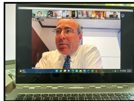
Federal Reserve Bank of Richmond President, Tom Barkin presents to RMC stakeholders.

On June 1, 2022, the RMC hosted a virtual Economic Update with the Federal Reserve Bank of Richmond President, Tom Barkin. Topics discussed were the state's current rural economic outlook and a discussion of issues that rural communities face.