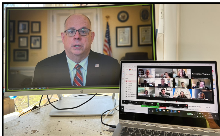
Governor Larry Hogan joined RMC by recording for Rural Maryland Day, held virtually on February 10, 2022.