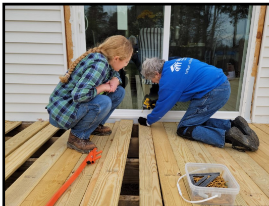
Habitat for Humanity Choptank, Inc. - Seniors Living Safely, Talbot County.