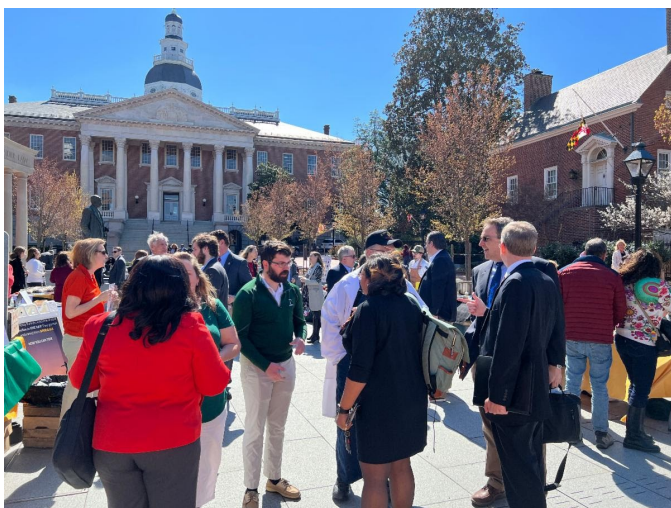
Photo: Legislators and participants enjoy 2022 Rural Maryland on Lawyers Mall, Annapolis, MD

Maryland Day was celebrated on March 25, 2022, the RMC held a Grab and Go Lunch for the Legislators at Lawyers mall in downtown Annapolis. The event was sponsored by the Maryland Broadband Cooperative, MARBIDCO, Southern Maryland Agriculture Development Commission, MidAtlantic Farm Credit, Maryland Department of Agriculture, and the Maryland Heritage Areas Coalition. The lunches consisted of locally grown foods and were provided by Caroline County's Chesapeake Culinary Arts Center.