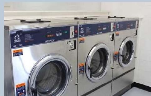
Photo Below: Industrial laundry equipment purchased with RMC Grant Funds.