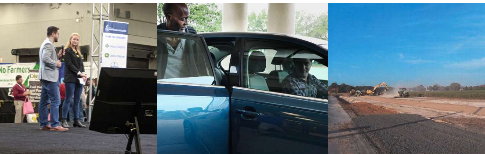
Hivelend, graduates of the F 3 Tech Accelerator program, presenting at the The Agriculture Innovation Challenge held during The Farm Bureau Federation's 2020 National Convention, Austin TX; Transportation to Wellness Pilot Project Clinic