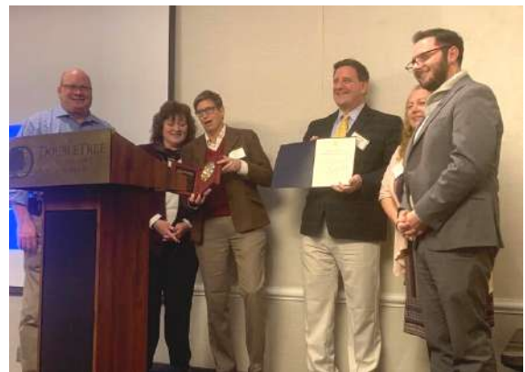
Cecil County Economic Development Team accepting Rural Economic Development Award.

Rural Economic Development Award to Cecil County Economic Development . The Cecil County Economic Development (OED), located in Elkton, MD, is a government agency that promotes business activity and development in the Cecil County area. The OED holds monthly Towns-County Meetings where the towns and the OED come together to discuss projects, issues and initiatives happening across the county. This relationship has helped not only the municipalities connect with each other and support efforts occurring in other parts of the county, but it has also allowed the OED to help with growth in towns and assist them in reaching their objectives. The OED has played a crucial role in the County's economic transformation, which includes the County ranking #2 for job growth in the State (1,352 new jobs in Cecil County in 2019 alone) along with the 3rd highest 1-year wage growth rate of all Maryland counties. Future projects in the Great Wolf Lodge in the Town of Perryville and hosting a Five-Star equestrian event at Fair Hill.