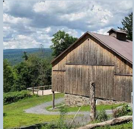
The barn at Evergreen Heritage Center used for events on the upper floor and a living history museum on the lower floor.

Rural Community Development Award to Evergreen Heritage Center Foundation . The Evergreen Heritage Center (EHC), a historic 130 acre Maryland farm, is located in rural Allegany County. The EHC Foundation, a 501(c)(3) public charity, was founded in 2008 to leverage the EHC to empower the region's children (in Allegany, Washington, and Garrett counties) through experiential education programs that are aligned with the Maryland State Curriculum. To pursue this mission, the EHC Foundation partnered with members of the academic, business, and public service sectors to develop both impactful education programs and Center infrastructure that would support those programs as well as other needs of the community.