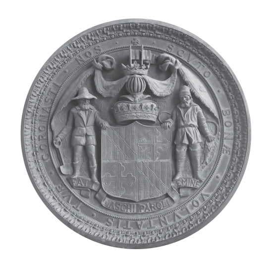
Joint Chairmen's Report Annapolis, Maryland 2015 Session

by the Chairmen of the Senate Budget and Taxation Committee and House Appropriations Committee