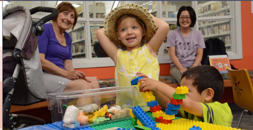
The former quiet room was repurposed for families and children.