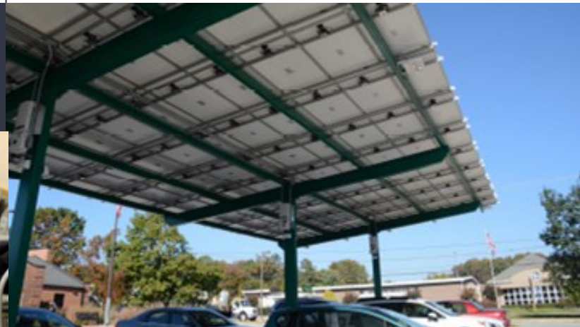
A new solar canopy generates significant energy savings.

CCPL's digital and physical resources and services enable all citizens to connect to self-directed learning opportunities such as Gale Online Courses, language learning with Rosetta Stone and Lynda, a video tutorial service, will launch in 2017. CCPL connects patrons of all ages with one-of-a-kind educational and cultural opportunities by offering more than 1,200 events annually.