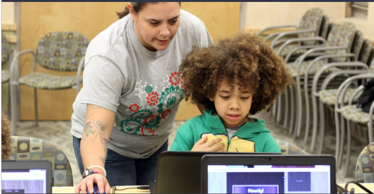
Families explore technology such as coding and additive printing in fun and engaging activities that develop skills necessary for our future workforce.

CCPL's digital and physical resources and services enable all citizens to connect to self-directed learning opportunities such as Gale Online Courses, language learning with Rosetta Stone and Lynda, a video tutorial service, will launch in 2017. CCPL connects patrons of all ages with one-of-a-kind educational and cultural opportunities by offering more than 1,200 events annually.