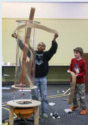
Mad Science & STEM activities. Special thanks to the CCPL Friends & APGFCU—our summer reading prize and program sponsors.