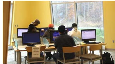
Computer skills classes at the Perryville Branch .

In 2014 CCPL was recognized as a leader in Maryland libraries' efforts to provide public library services designed to enable veterans to overcome serious issues like unemployment and homelessness.