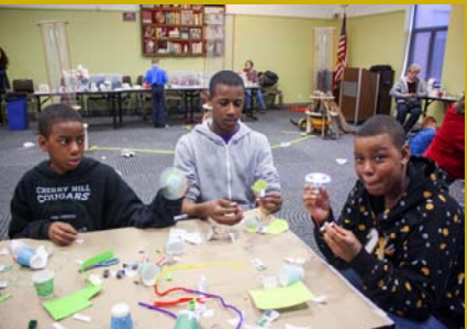
Teens thrive at Cecil County Public Library

A high school drop-out earns an average of $7,500 less than a high school graduate—amounting to hundreds of thousands of dollars lost over a lifetime.