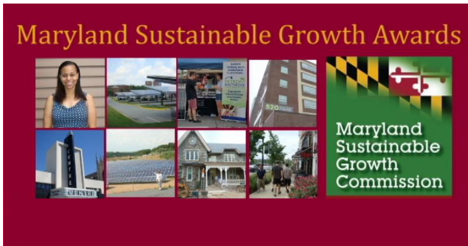
Eight people and projects received 2016 Sustainable Growth Awards.