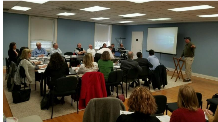
The Maryland Sustainable Growth Commission meets bi-monthly rotating at locations throughout the state. Pictured here, the commission met at Chestertown Town Hall in November.

With the appointment of many new members to the Growth Commission in 2016, much of the Commission's attention has focused on learning first-hand about the growth challenges facing local governments, particularly in the rural parts of Maryland – visiting Allegany, Caroline, Harford and Kent Counties. The Commission has continued to work on the recommendations from the Reinvest Maryland: Accelerating Infill, Redevelopment & Community Revitalization report, identifying how state and local governments can work together to spur reinvestment into our existing communities. Additionally, the Commission's Rural Economies Workgroup made significant progress investigating local food production opportunities, enhancements to Maryland's forestry industry, the needs for continued state land preservation efforts, and reducing impediments to rural development.