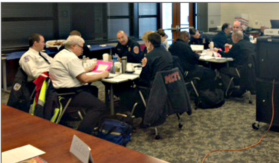
On January 28 and 29, 2014, thirty-six Maryland EMS providers participated in an ambulance strike team leader course instructed by Texas A&M Engineering Extension Service (TEEX). Funding for the course was provided by Montgomery Fire and Rescue's Emergency Response System project. This course and future offerings are being held as part of MIESS' effort to develop pre-designated ambulance strike teams that can respond quickly to emergencies in Maryland as well as other states.

Registration information available soon on www.miemss.org