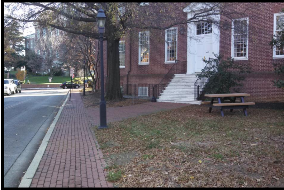
Rear of Department of Legislative Services Building on North Street