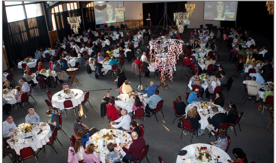
Guests at the first annual Night for Stars Stellar Service Awards enjoy a video presenting first-hand accounts of the award-winning EMS calls.