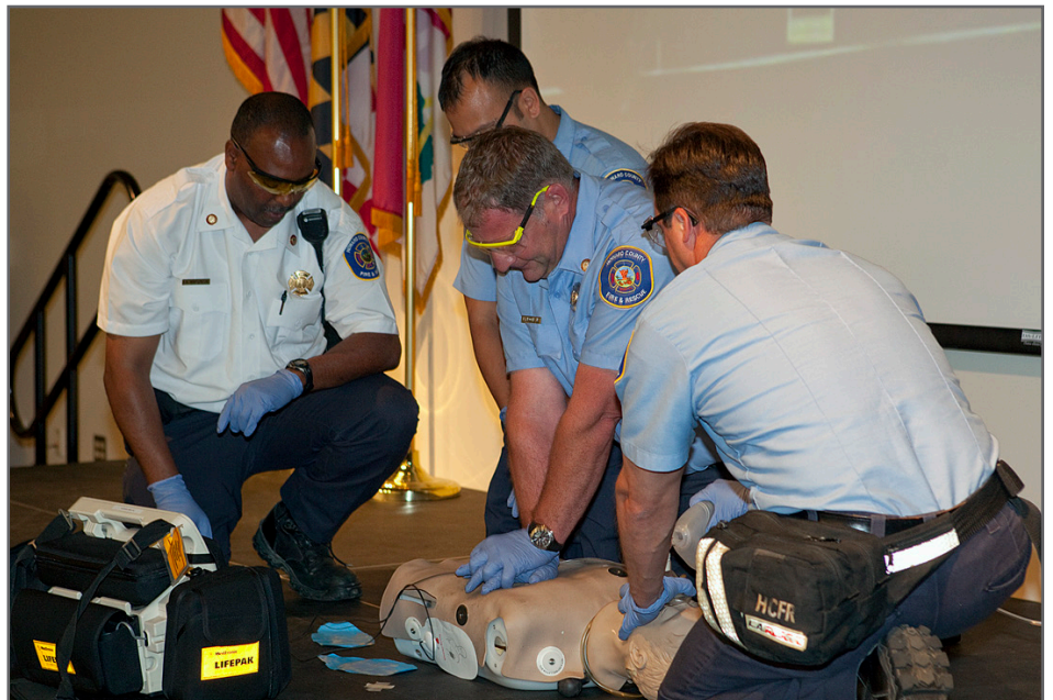
Members of HCDFRS demonstrate high-performance CPR at the Cardiac Arrest Resuscitation Experience Symposium in Howard County on May 6, 2012. Each Provider is assigned a specific role during the resuscitation, and the method is timed precisely.

All ALS Providers should have submitted renewal applications to MIEMSS by April 16, 2013, to ensure that they will receive a new card by the end of month. If you are an ALS Provider and have not yet renewed, please do so as soon as possible. The preferred application process for Providers with NREMT I-99 and Paramedic certifications is via the on-line application. To log on and renew, visit www.miemss.org , then click on Provider login on the right-hand side of the screen.