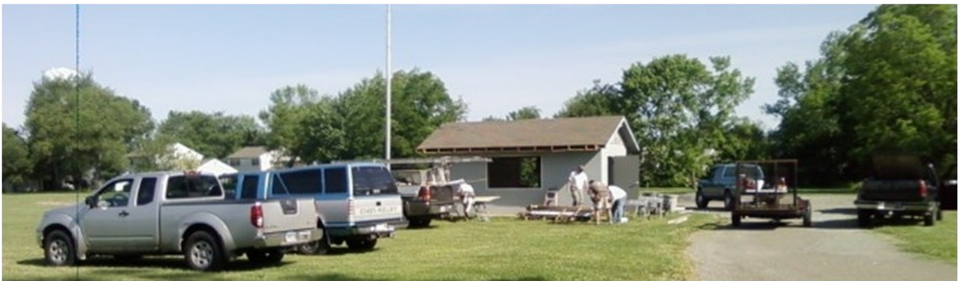
Trappe LIONS gathered on Saturday, May 19th to continue work on the concession stand in the old ball fields located behind Trappe Veteran's Memorial Park on Main Street.