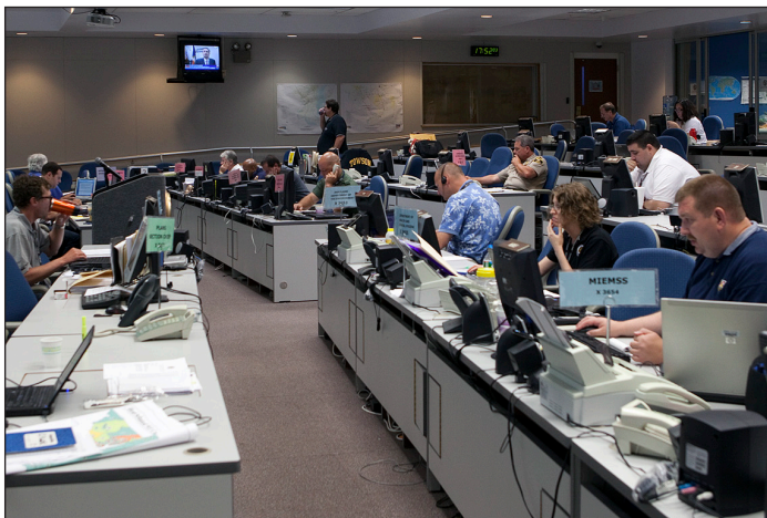
The MEMA State Emergency Operations Center (SEOC) was activated during the recent storms and heat emergency events.

The storm left many critical facilities without power. These included fire stations, hospitals, skilled nursing facilities, large assisted living and senior homes, as well as water pumping facilities and other critical infrastructure. As the period of time without power grew, the most problematic sites became skilled nursing facilities and residential homes housing vulnerable populations. Many of these facilities did not have generators; others had generators that were not able to power facility air conditioner units. By noon on June 30, MIEMSS and the Maryland Department of Health and Mental Hygiene (DHMH) were aware of 13 facilities that had contacted State or local representatives to report power or air conditioning issues. As the afternoon progressed, this number grew significantly as calls were made to all facilities in the state. Many facilities had been near crisis but had not reported their status to local or state representatives. By 10 PM that night, DHMH, MIEMSS, and the Maryland Emergency Management Agency (MEMA) were tracking 64 hospitals, nursing homes, or assisted living facilities that had power/air conditioning issues.