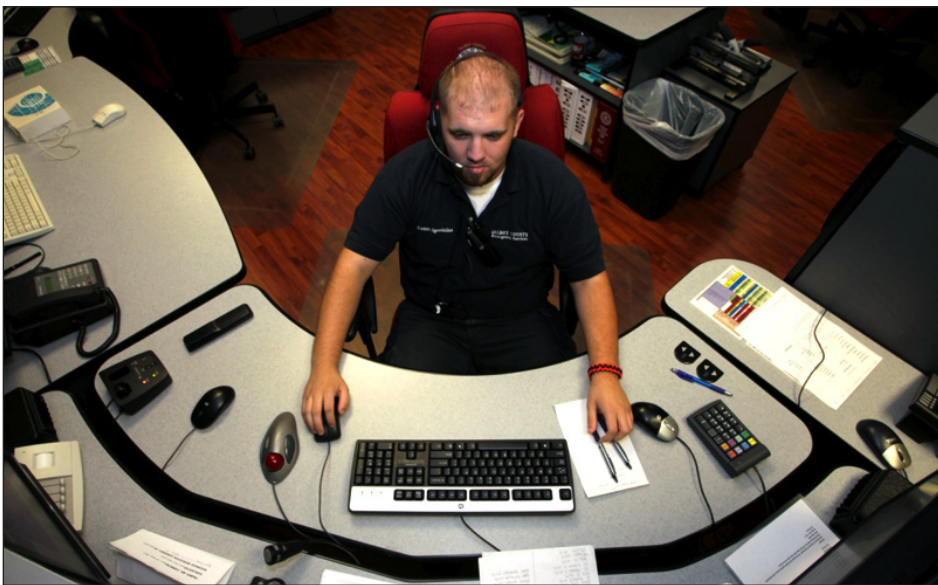
Views of the newly expanded Region IV EMRC that went online in April 2012. Many Eastern Shore providers can expect better communication with hospital-based providers statewide.