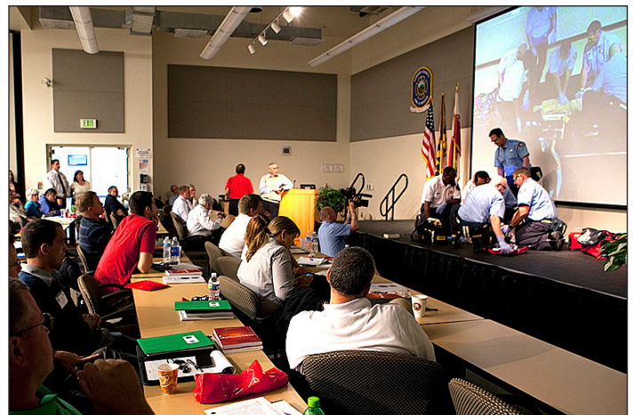
Attendees at the Howard County C.A.R.E.S. Program observe members of the Howard County Department of Fire and Rescue Services performing a resuscitation demonstration.