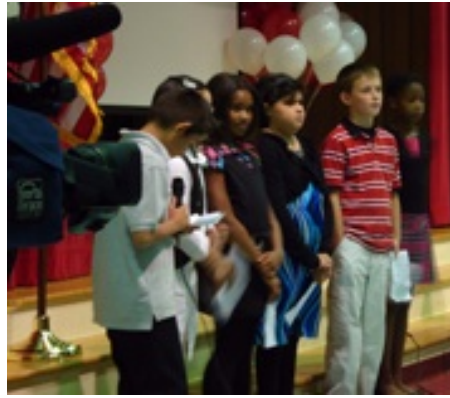
Students at Talbott Springs Elementary helped celebrate the launch of October at Parent Involvement Month