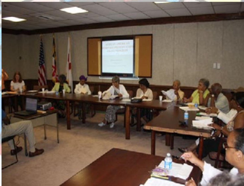
African American Heritage Preservation Grant Workshops, June 5 & June 12