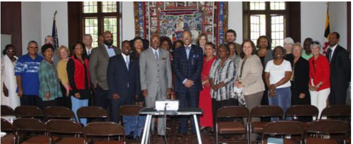
MCAAHC Meeting, The State House of 1676, Historic St. Mary's City, September 20