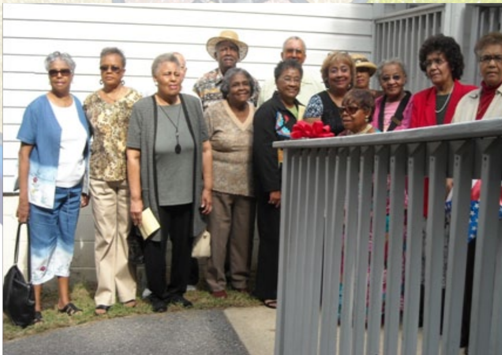
Former Students at Queenstown Rosenwald School