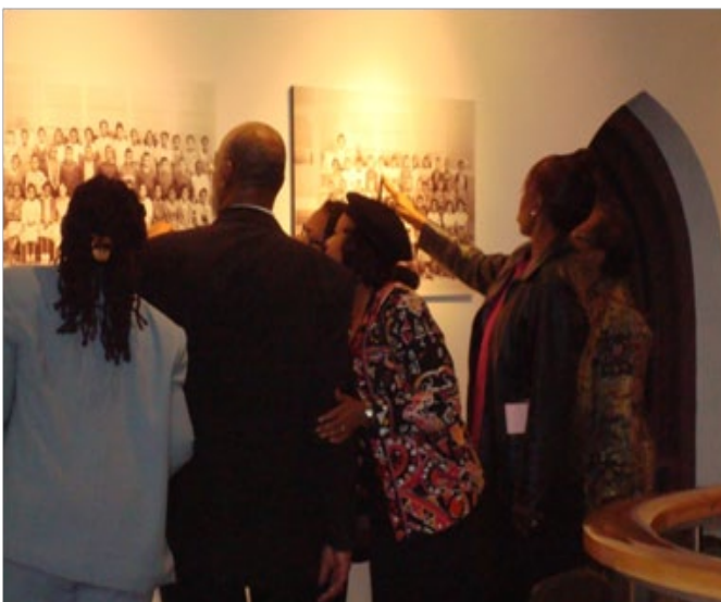
Members of the community enjoy Class of 1954

The pictures exhibited on this floor of the exhibition show the faces of Parole Elementary School in 1954, the year of the Brown v. Board of Education decision. Identification sheets were located in the exhibit to allow community input.