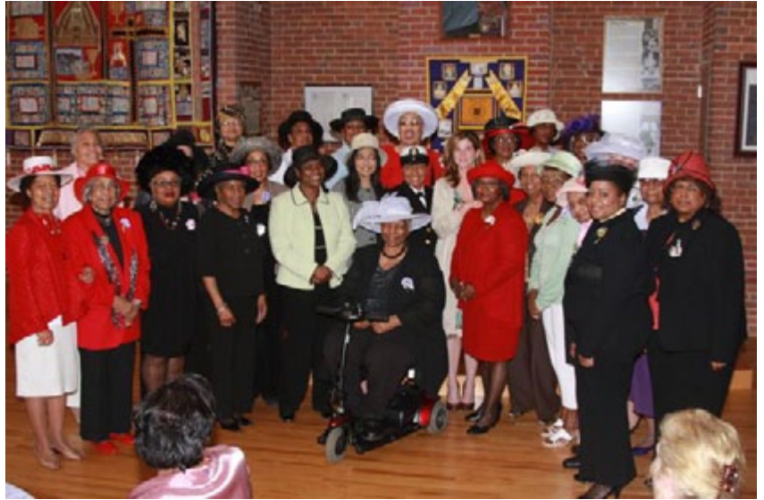
Participants of Ladies Hats and Tea