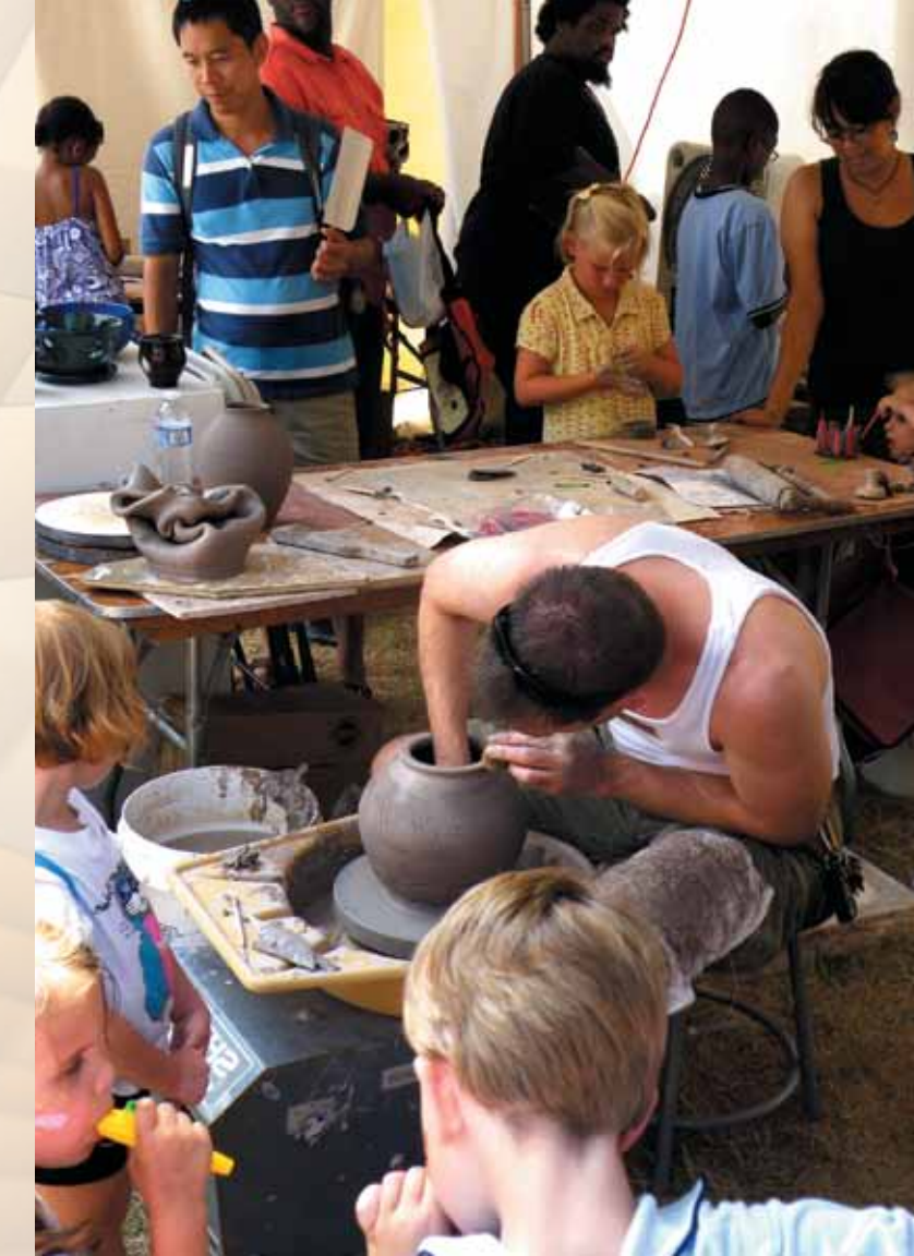
Children's classes, Baltimore Clayworks; Alice and Caterpillar, Quest: Arts for Everyone

The lists represent Councilors, Commissioners and Staff who served full or partial terms during FY 2010.