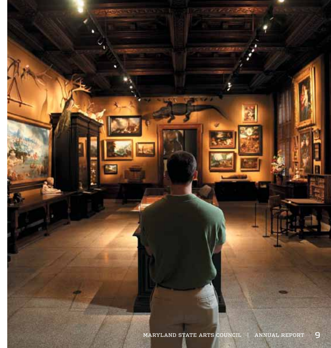
Chamber of Wonders, Walters Art Museum

The Challenge America program is a federal program funded by the National Endowment for the Arts to provide state arts agencies with funding to support programs that reach out to underserved or rural populations. In FY 2010, Community Arts Development Challenge America grants supported programs of five county arts councils for a total of $13,375. ARTvantage grants supported 15 innovative partnerships between arts organizations and communities for a total of $86,500.