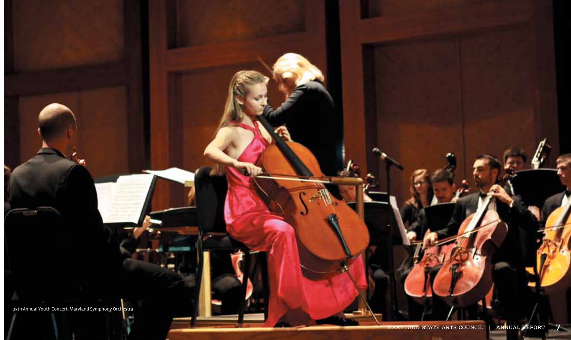
25th Annual Youth Concert, Maryland Symphony Orchestra