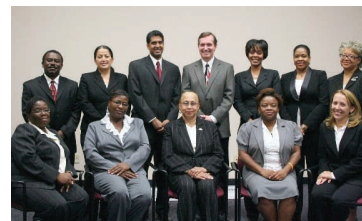
MHHD Team October 2008