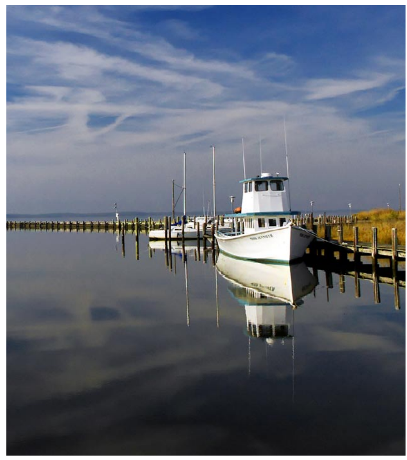
Maryland has now installed more marine sewage pumpout facilities than any other state in the nation!

Worked with the Governor's office and legislative leaders to strengthen Maryland's Critical Area Law for the first time in 25 years.