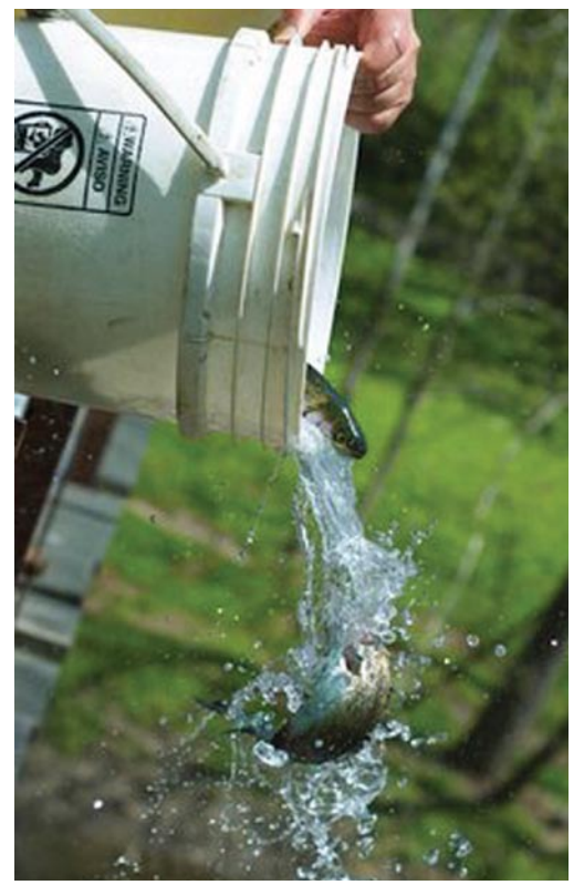
Each spring DNR fisheries staff stock several hundred thousand rainbow and brown trout into freshwaters across Maryland for fishing enthusiasts.

Worked with Governor O'Malley and the legislature to ban the commercial harvest of terrapins and limit their recreational harvest.