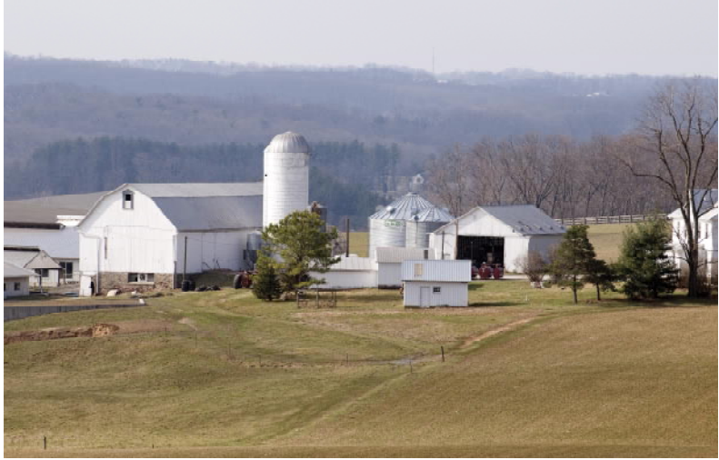
Rural Legacy Program

Worked with partners across the State to acquire 9,400 acres of land through State-side Program Open Space . In 2007, this included protection of 718 acres of sensitive landscape that had been slated for Blackwater Resorts development.