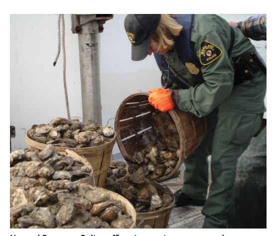
Natural Resource Police officer inspecting oyster catch.

Graduated a class of 17 newly appointed Natural Resources Police law enforcement officers — the first class since 2002.