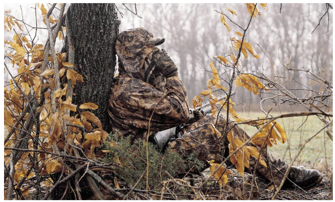
Maryland hunters now enjoy outstanding turkey seasons, with populations in every county due to a DNR state-of-the-art relocation project using wild-trapped birds conducted in the 1980s and 90s. Prior to the relocation project, turkeys were restricted to a few counties in western Maryland and a small population in southern Montgomery County.

Made several exciting discoveries concerning the State's rarest bat species during surveys of the Indigo Tunnel in Allegany County: Maryland's first known hibernacula of the silver-haired bat; the largest documented hibernacula of the small-footed bat; and a swarming of the federally-endangered Indiana bat.