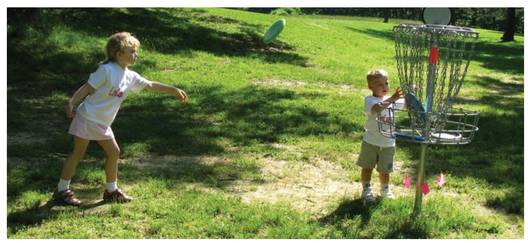
During 2007 and 2008, DNR directed $886 million in Program Open Space funding to Maryland counties and Baltimore City to support 555 local recreational projects and acquisitions, as well as community, parks and playground projects.

Directed 26.2 million in waterway improvement funding to 334 local projects across the State and celebrated the completion of several major projects, including Baltimore City's New Inner Harbor Marina, the Annapolis City Marina and Cambridge Municipal Marina expansions.