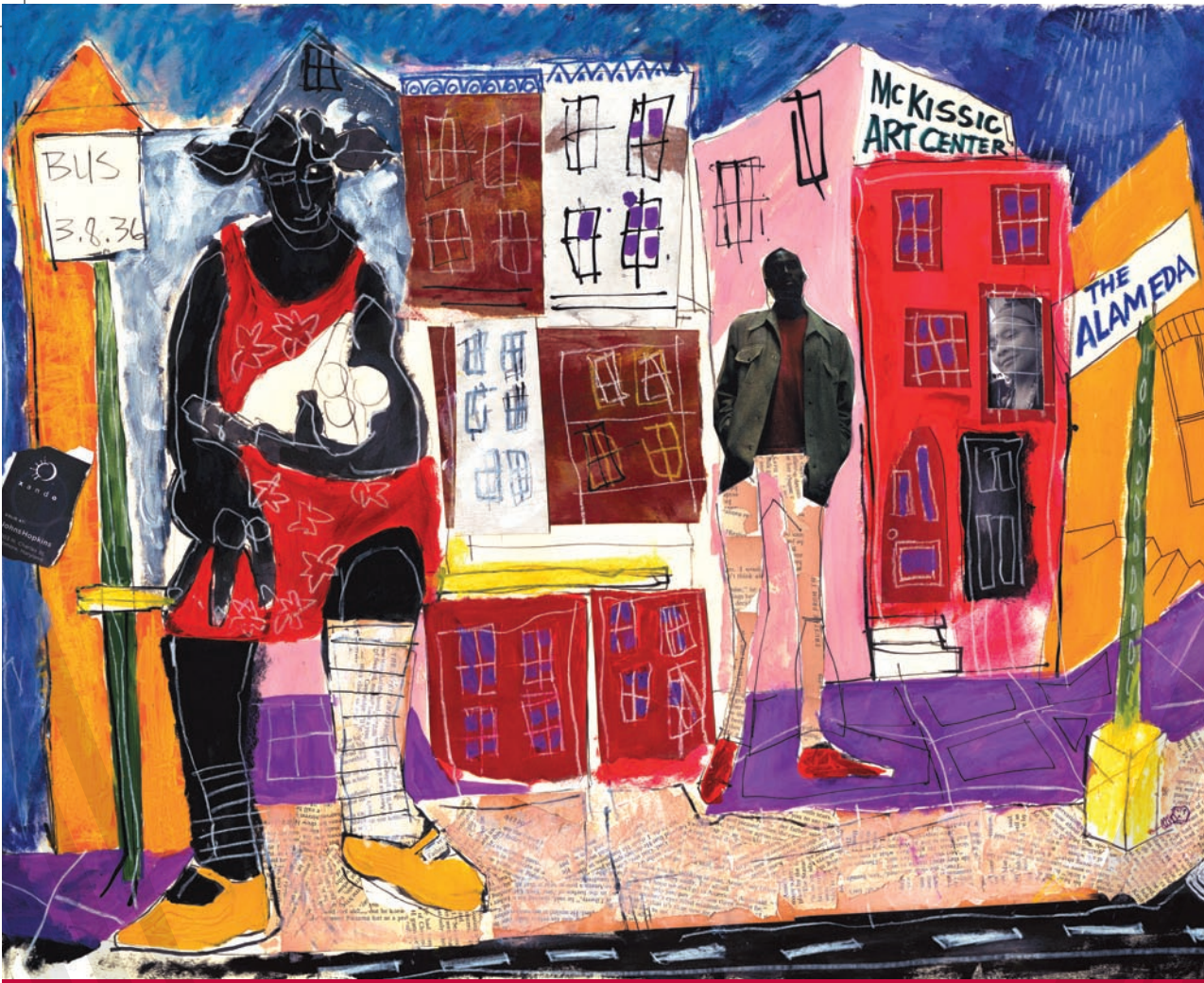
"Baltimore Street" by Don Griffin, Contemporary Arts, Photo by: Don Griffin | "The Glass Menagerie," Olney Theatre, Photo by: Stan Barouh