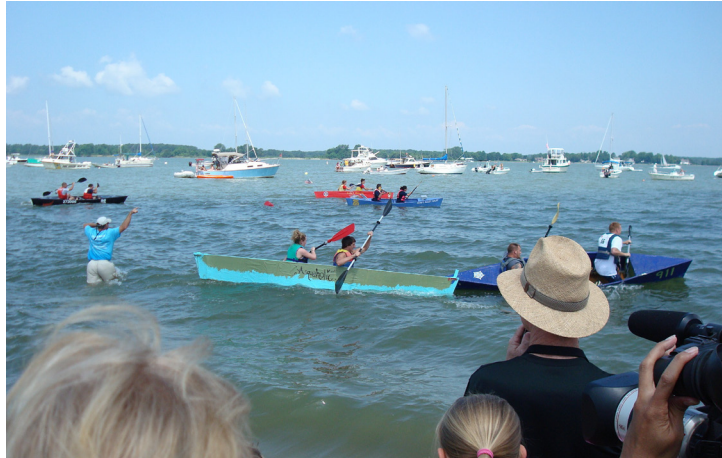
Talbot Co Juvenile Drug Court Participants in the Annual Cardboard Boat Race to support Special Olympics.

Maryland celebrated its 6 th Drug Court Month in 2009. Drug Court Month is a national, state, and local celebration in recognition of the many accomplishments of our drug court participants. Drug court programs in Maryland use that month to showcase the programs participant progress, program services, and partnerships. Common activities include: family reunification ceremonies, graduations, open houses, volunteer service projects, athletic and sporting events, and organized picnics.