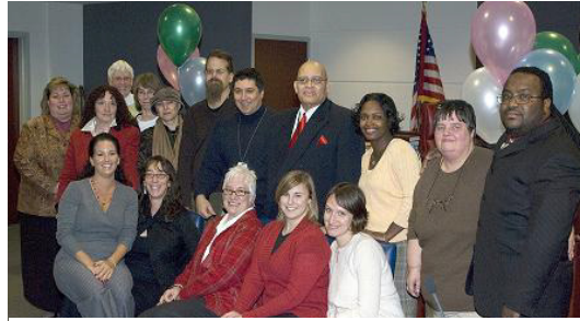
Baltimore City Mental Health Court Team

These case consolidations would set the stage for the onset of the first ever problem-solving court in Maryland designed to assist defendants diagnosed with mental illness. The court strives to avoid repeated incarceration for mentally ill defendants by engaging them into wrap-around treatment services within their community.