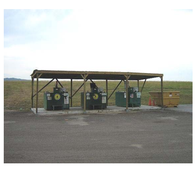
BALTIMORE COUNTY RESOURCE RECOVERY FACILITY

Submitted by: Maryland Environmental Service