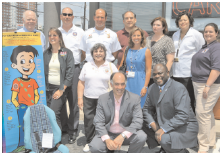
Many gathered at the Fitzgerald Auto Mall in Montgomery County on June 25 to participate in a press conference to heighten the public's awareness about Maryland's new Child Passenger Safety Law effective June 30.

In 2002, Delegate Bronrott and Senator Forehand sponsored legislation that made Maryland the first state in the Mid-Atlantic region with a child booster seat law, but an amendment limited it to a half-strength requirement that has protected child passengers only until they turn age 6. With the new 2008