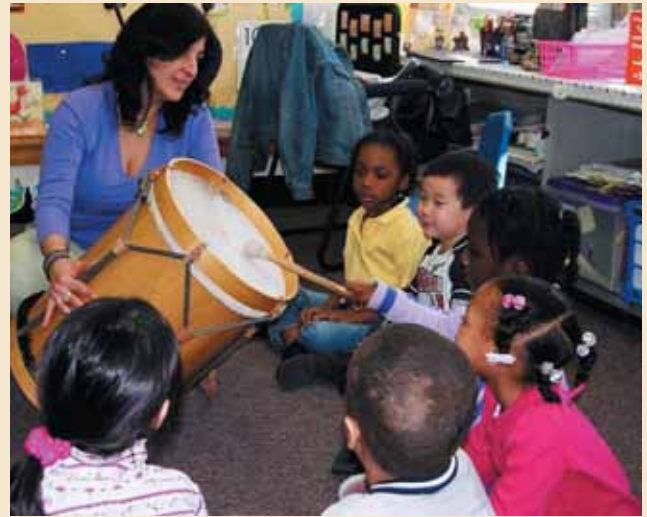
HOWARD COUNTY CENTER FOR THE ARTS