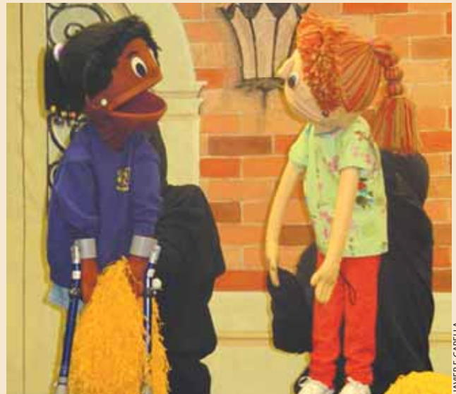
THE KIDS ON THE BLOCK, INC.

Grants for Arts Partnership Initiatives encourage collaborations between local boards of education and arts organizations. Partnerships are an essential ingredient in each local system's Fine Arts Strategic Plan. Grants for Arts Partnership Initiatives offer funding opportunities to develop, enhance or implement processes, procedures, or programs that support the Fine Arts Strategic Plan as reflected in the local system's Master Plan. In FY 2006, MSAC awarded four Grants for Arts Partnership Initiatives, one each to Allegany County Public Schools, Baltimore County Public Schools, Washington County Public Schools and Worcester County Public Schools, for a total of $19,105.