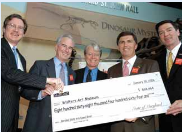
GOVERNOR'S CELEBRATION OF THE ARTS

In FY 2006, Arts Maryland , MSAC's e-newsletter, included feature articles, a column on upcoming regional and national events and a grant deadline column, as well as links to arts resources. Each edition of Arts Maryland was emailed to more than 4,000 email addresses. In FY 2006, MSAC also continued regular email bulletins to its grantees and constituents announcing grants, opportunities and programs, as well as invitations to MSAC gallery openings, receptions and other events.