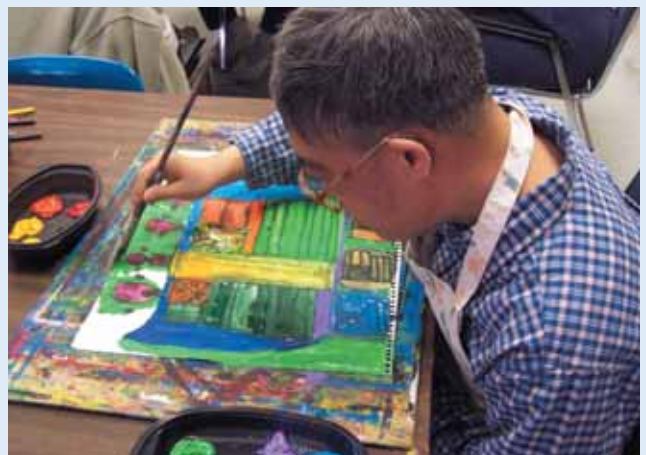
PROVIDENCE ART INSTITUTE

The Web site is also the portal to eGRANT, the Maryland State Arts Council's Internet-Based Electronic Grant Application System. Arts organizations used the system successfully to apply for grants and to submit interim and final grant reports. Data from eGRANT applications and reports are automatically merged into MSAC's custom Automated Grants Management Database System to accomplish efficient reporting.