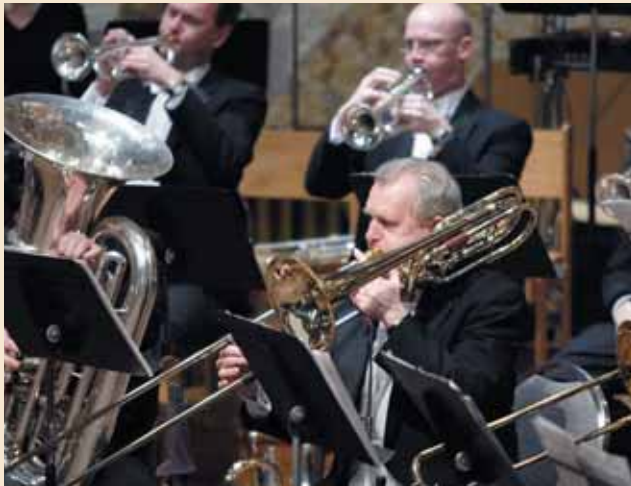
WASHINGTON SYMPHONIC BRASS

The Community Arts Development program also offers Technical Assistance and Professional Development grants to assist in providing professional