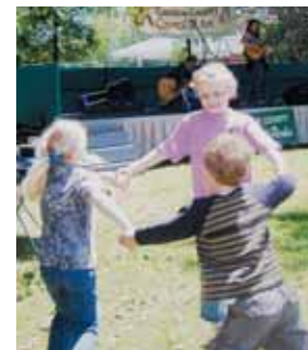
CAROLINE COUNTY COUNCIL OF ARTS