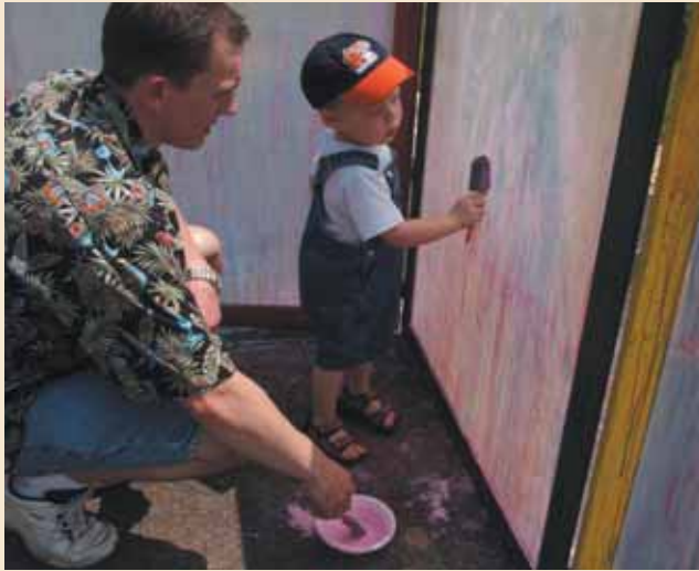
FREDERICK ARTS FESTIVAL