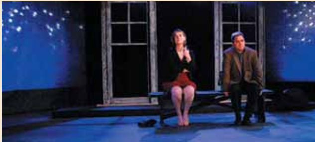
SILVER SPRING STAGE

The ARTvantage program fosters and supports the creativity of Maryland’s artists and organizations to engage with communities. It also explores ways to innovatively serve the citizens of Maryland, expand arts participation to citizens who have limited opportunities to experience the arts and encourage partnerships among organizations. ARTvantage grants range from $5,000 to $20,000. Eligible applicants must be Maryland-based, non-profit organizations. In FY 2006, MSAC awarded ARTvantage grants totaling $132,460 to 15 Maryland organizations.