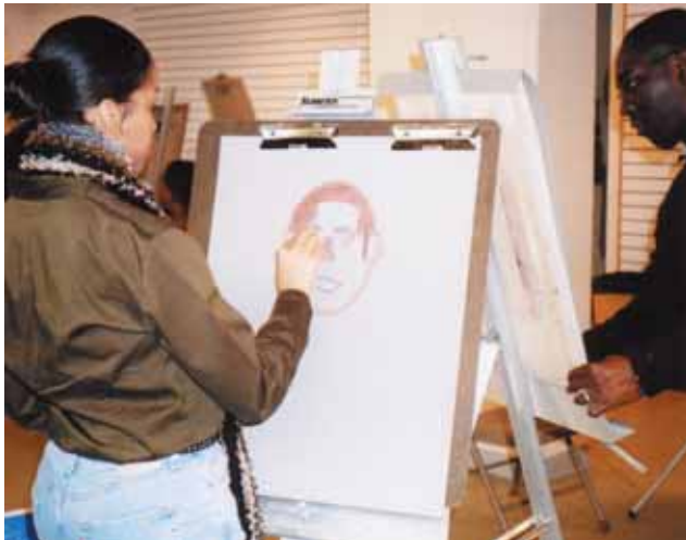
DORCHESTER ARTS CENTER

*Statistics for this study were drawn from 261 Maryland organizations that produce or present the arts around the State, receive grants from the Maryland State Arts Council for ongoing support of their operations and programs, and represent activities for fiscal year 2004. The study does not take into account the economic impact of for-profit arts organizations and the activities of individual visual, performing and literary artists.