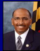
MICHAEL S. STEELE LIEUTENANT GOVERNOR