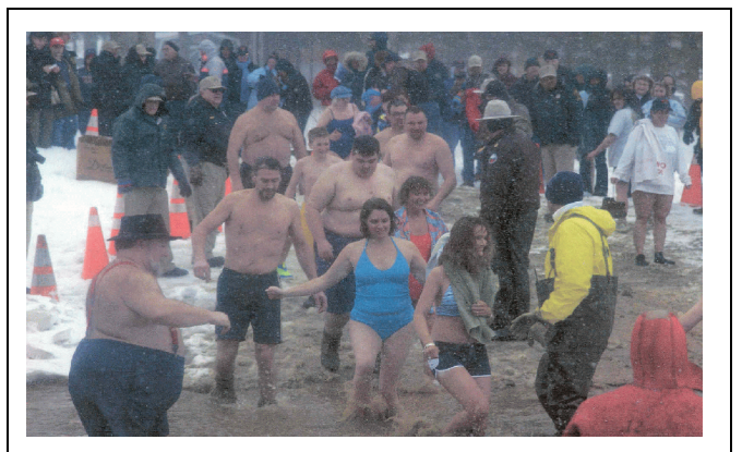
Dunkers head for the chilly waters of Deep Creek Lake during the 6 th Annual Maryland State Police Deep Creek Dunk.

Many thanks to our law enforcement and state partners who joined the Maryland State Police in making this event a success. They included the Maryland Natural Resources Police, Maryland Department of Natural Resources - State Forest and Park Service, State Highway Administration, Garrett County Sheriff's Department, Oakland Police Department and the Allegany County Sheriff's Department.