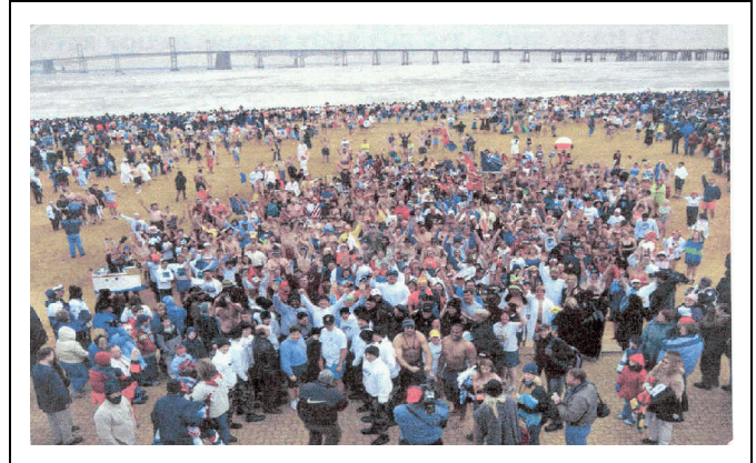
Thanks to the 1,908 plungers who braved the frigid temperatures on January 24, 2004, showing their support for Maryland's Special Olympians.

This year's sponsors included Uno Restaurant & Bar; Wisp Resort Hotel and Conference Center; Harley Davidson of Maryland, Inc.; Garrett County Chamber of Commerce; Wisp at Deep Creek Mountain Resort; 104.5 WKHJ; 92.3 The Train; Long and Foster Realtors; Saucy Salamander Catering Company; Seattle's Best Coffee; Tub Tech; American Legion; Toyota; Bear Claw Snow Tubing