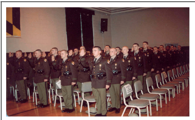
The 120 th Trooper Candidate Class repeats the oath of office at the graduation ceremony on February 6, 2004.