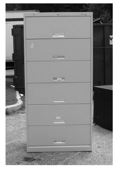
Lateral filing cabinet $40