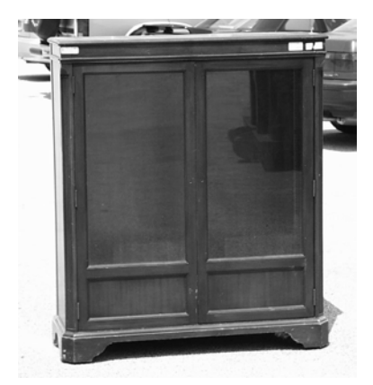
Glass-Door Bookcase $90