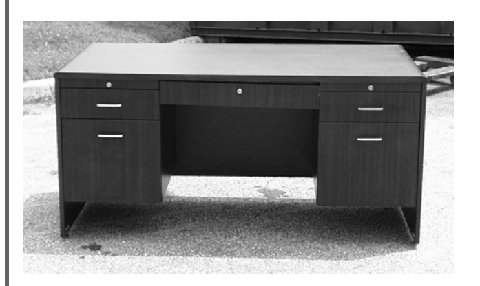
Wooden Desk $60