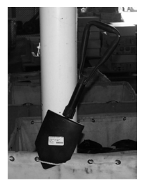
Entrenching Tool $7