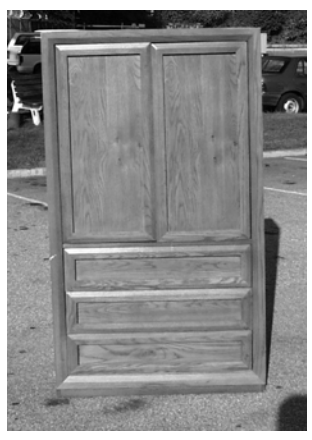
Entertainment Center $55