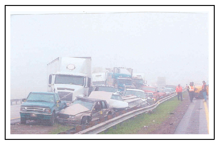
Dense fog contributed to the accidents on and the shutdown of I-68 in Garrett County, Maryland.

The crash investigation is being conducted by troopers from the State Police Crash Team with assistance from the National Transportation Safety Board. Personnel from the State Highway Administration, Garrett County Roads, Cumberland Police Department and Garrett County Sheriff's Department responded to assist with traffic detours. More than 30 fire and rescue units from Maryland, West Virginia, and Pennsylvania responded to treat the injured.