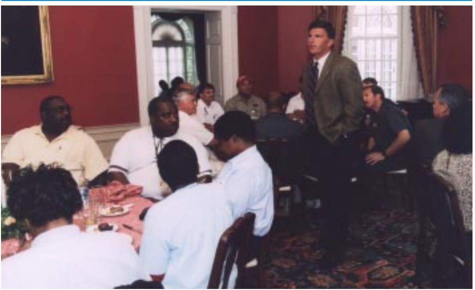
Thanks! At a State House luncbeon, Governor Ebrlich thanks members of the Annapolis Public Buildings and Grounds staff for making Government House a "comfortable" home for the First Family.