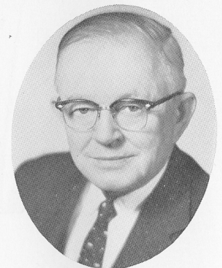
J. Millard Tawes Governor of Maryland

MARYLAND'S Flag, Seal, Song, Flower, Bird and Tree